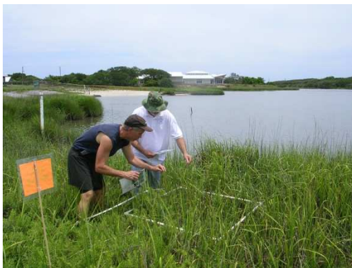
NERR Researchers in the field ( Guana Tolomoto Matanzas Reserve )