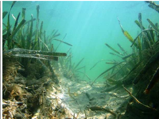
Big Bend (FL)