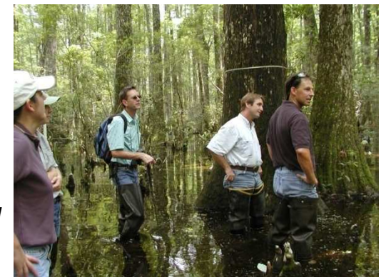
NERR Researchers in the field ( North Inlet Coastal Training Program )